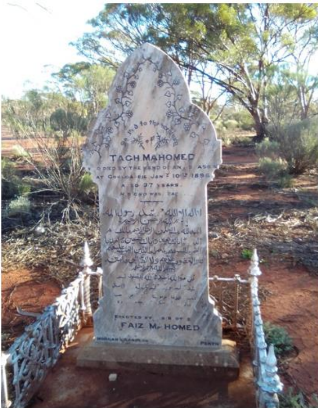
The inscription reads "Tagh Mahomed who died at the hand of an assassin at Coolgardie Jan 10 1896 aged 37 years. His end was peace".

The introduction of the Immigration Restriction Act 1901 and the White Australia policy made it more difficult for cameleers to enter Australia and the numbers soon dwindled. By the 1920s motor cars and rail had replaced the camels as a form of transport and they were no longer needed.