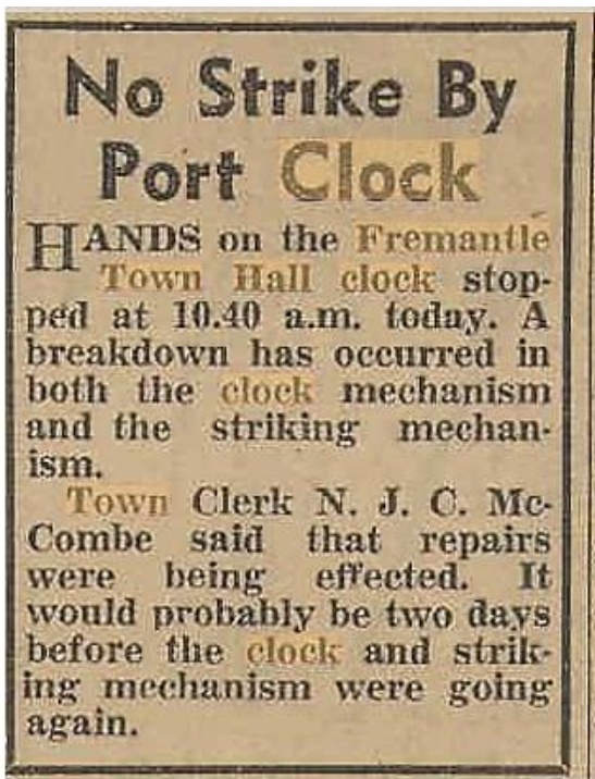
Daily News , 23 January 1951, p 3

On Wednesday night the Fremantle Town Hall clock, evidently under the impression that everyone was in bed, anyway, and that nobody cared about the time, relaxed and enjoyed itself. At 1 a.m., tired of the old monotonous routine, it struck 12. At 2 a.m. it introduced a little more light relief by whizzing on eight melodious notes. Flushed with success, it could hardly wait until 3 o'clock, when it struck nine. My spy kept the clock under close observation for any further signs of mechanical madness until four in the morning and then went to bed. 15