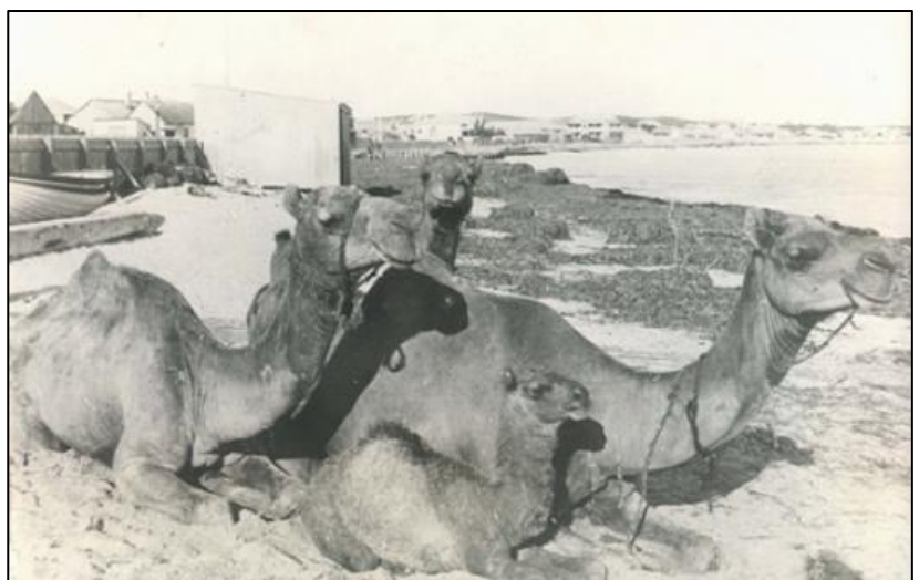
Camels resting after their long trip on the beach at Marine Terrace C. 1900s. Photo Azelia Ley Museum AL.85.97.10