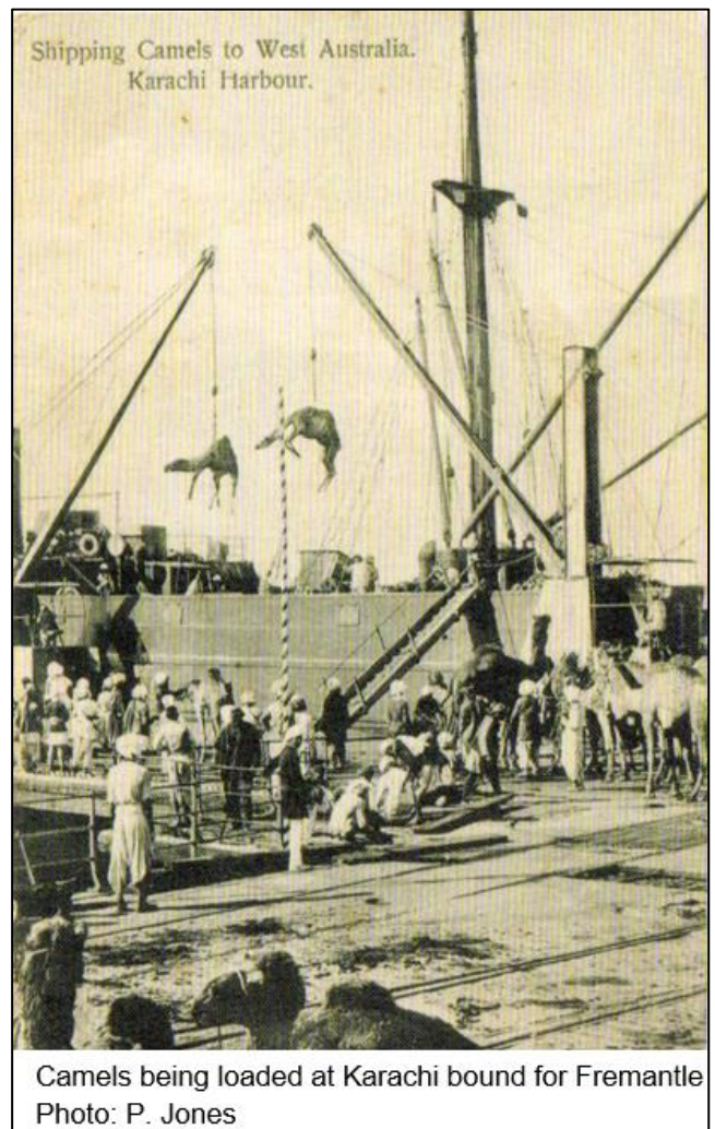
Camels being loaded at Karachi bound for Fremantle

Camels had been used in the Eastern states since the 1860s, particularly in South Australia, where they were integral to the building of the Overland Telegraph Line in the 1870s. The infamous Burke and Wills expedition was Australia's first major inland expedition to use them as the main form of transport. The cameleers, known as Afghans or Ghans, were needed to care for and take charge of the animals. Many came from Afghanistan but there were also many from Baluchistan,