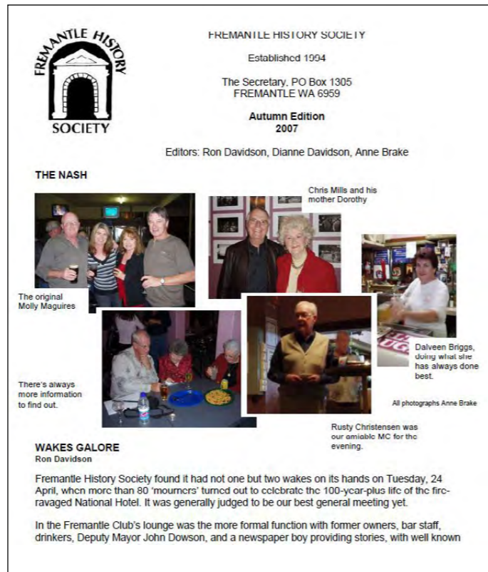
Photos from the Nash Wake adorned the front cover of the autumn edition, 2007

The hotel languished again. Then in 2012 it was purchased by Singapore-based Carnegies International Group and restoration work recommenced. It is now hoped that the 'Nash' will reopen as a fully functional hotel before Christmas 2013.