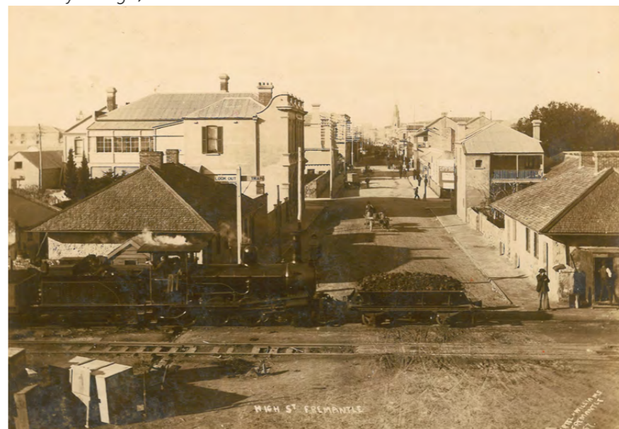
High St, Fremantle