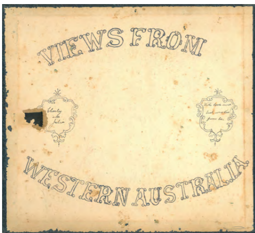
Inscription in the front cover of the album