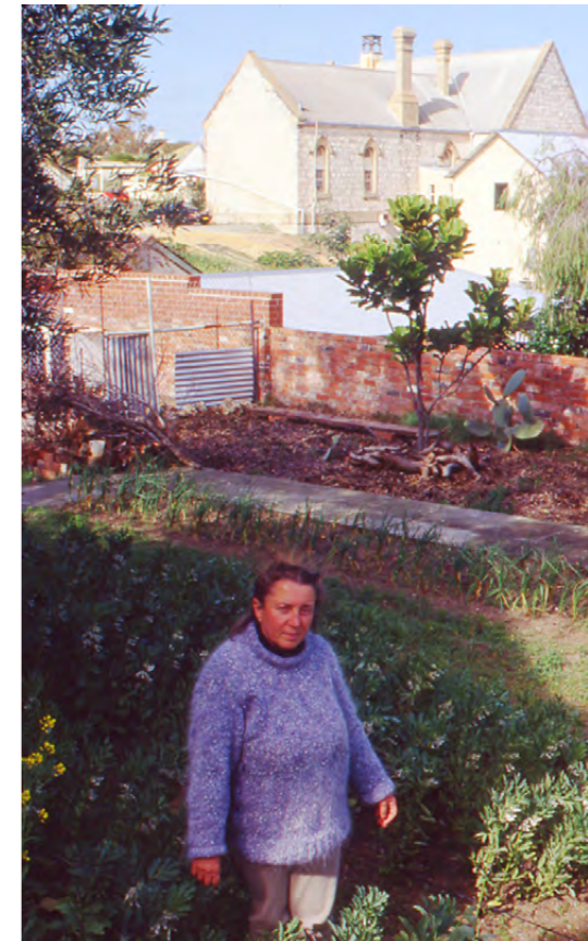
This garden in Ellen Street was an example of a model southern Italian productive garden which unfortunately disappeared when the house (built in 1901) was extensively renovated in 1998. Note former Fremantle Grammar School (1885) Nos. 196-200 High Street in the background. BS1283

Nostalgia interrupted the desire to become 'real Aussies' as demanded by the popular press. In the days before the internet and easy access to phones, homesickness could not be alleviated by interaction with those left behind. By the time the children were grown up and a level of wealth had been achieved the