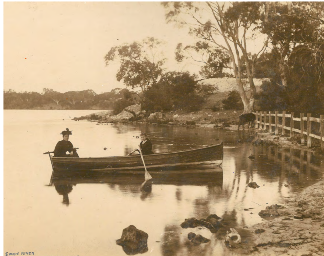
Swan River near (East) Fremantle