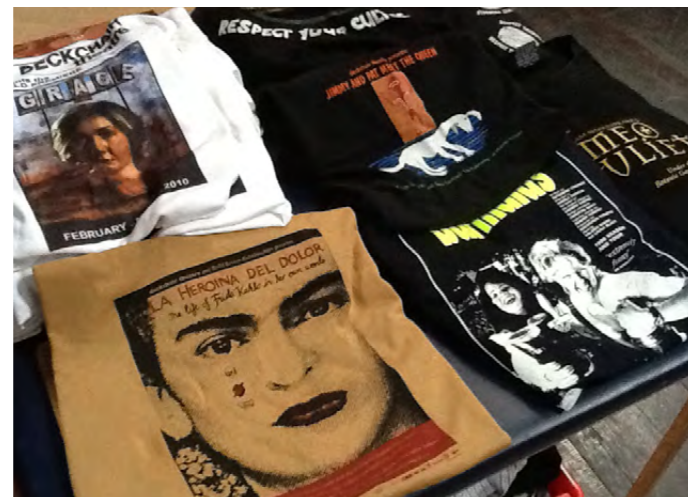
Examples of T-Shirts to support a number of the Deckchair productions over the years.