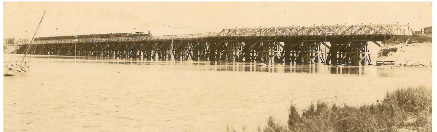
Railway Bridge, Fremantle