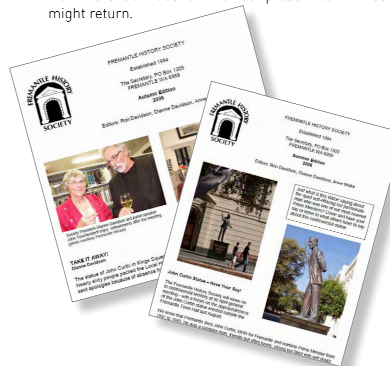
Coverage of the Curtin statue fiasco in the summer and autumn editions of 2006

Now there is an idea to which our present committee might return.