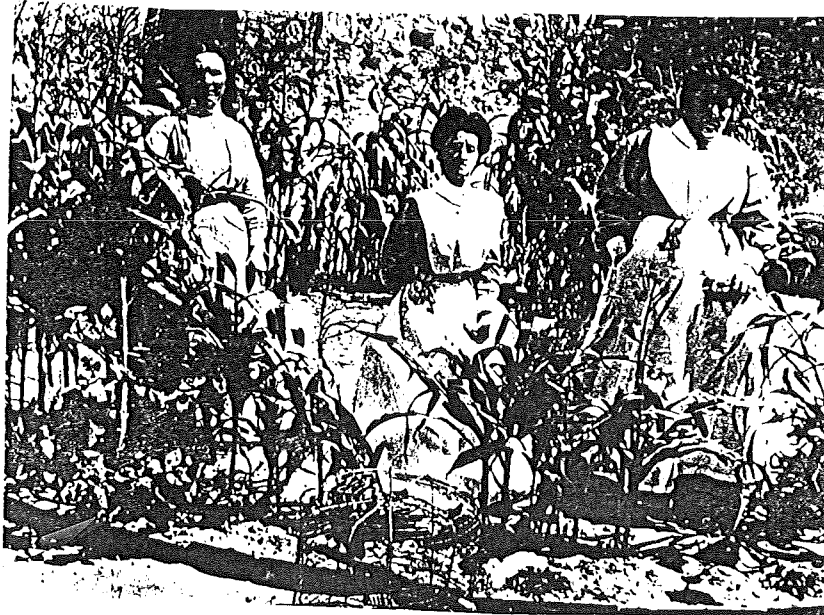
Matrons in the Garden of Fremantle Prison (no date)